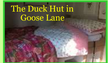
The Duck Hut in Goose Lane