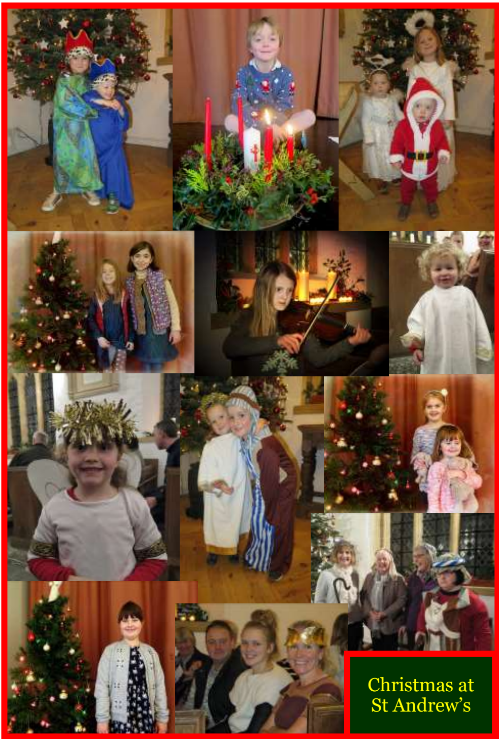
Christmas at St Andrew's