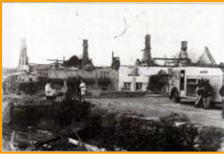
The old Shop at the Cross

Thanks to all the people who took part in the discussion about the pictures posted onto the Compton Dundon Facebook page of the fire in the centre of the village in the 1970's