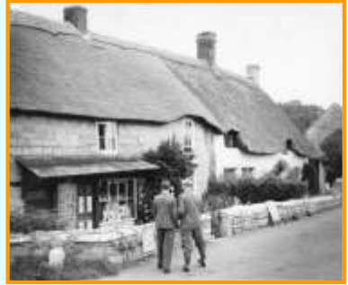
The Shop before the fire